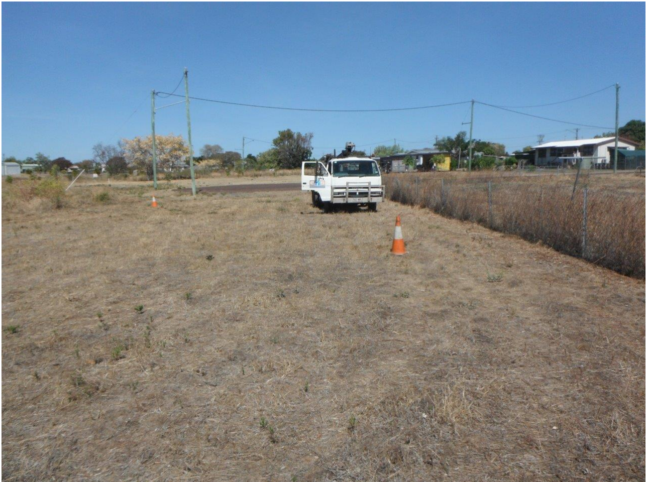
Photo of the allotment