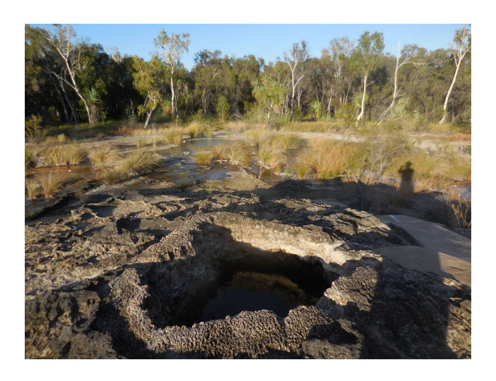
Talaroo Hot Springs

The abovementioned visit to China undertaken in September 2017 has resulted in a proposal, discussed with senior Guizhou Province Government officials, predicated on the following assumptions and approach designed to attract a geotourism-primed Chinese market to consider travel to Far North Queensland Region (including Etheridge Shire).