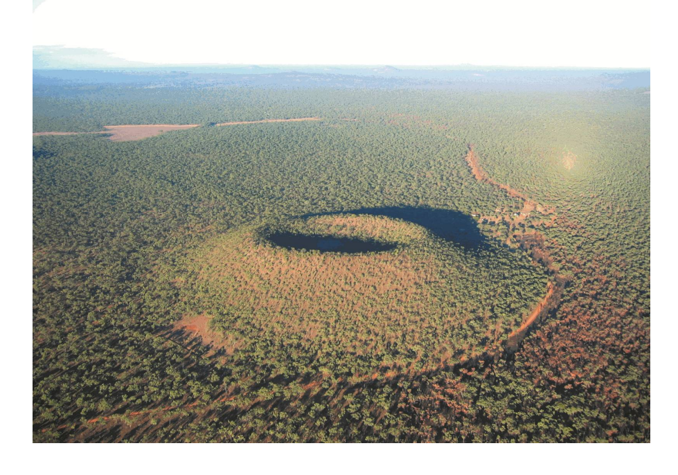
Kalkani Cone, Undara

And travelling en route from Cairns, a stop over to visit the very picturesque peaks, lakes and waterfalls of the Atherton Tableland.